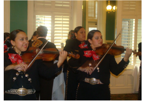
Mariachi Las Altenas

voted in as the newest profession accredited by CAAHEP. Several CoAs were spotlighted this year, providing attendees with an overview of those professions. In addition, an overview of the CoA-EMSP and its collaboration with CAAHEP in marketing accreditation to potential programs was reviewed. Attendees were also brought up to date with changes within METC—the largest consolidated, state-of-the-art military health training facility in the history of the Department of Defense. While Fiesta kicked off next door at the Alamo, the CAAHEP Annual Meeting culminated in its own Fiesta Reception featuring a terrific performance by the all-female Mariachi band, Las Altenas.